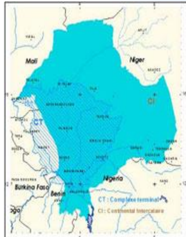
Iullemeden Aquifer System